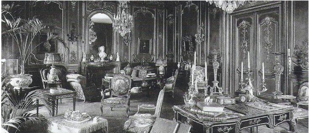
Reception Room at the Gould Mansion, 857 Fifth Avenue, New York, created 1907-09

Description: Established in 2006, our Seminars in the History of Collecting series helps fulfil our commitment to the research and study of the history of collections and collecting, especially in the 18th and 19th centuries in Paris and London.