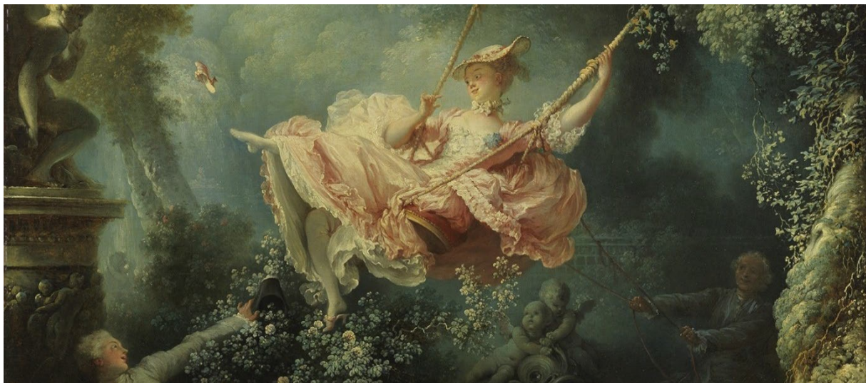
Jean-Honoré Fragonard, Les hasards heureux de l'escarpolette (The Swing) , about 1767-68 (detail)

Fragonard's Les hasards heureux de l'escarpolette , known in English as The Swing , is a revered painting in the Wallace Collection and one of the most representative works of art of the entire French 18th century. To celebrate the gentle cleaning and restoration of this rococo icon, we have invited five art practitioners and five scholars to participate in a series of virtual conversations inspired by its key themes: Pink, Identity, Fashion, Play, and The Libertine.