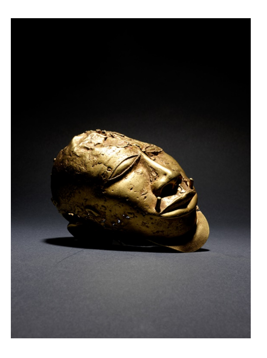
Gold Trophy Head 19<sup>th</sup> century or earlier, Asante (Ghana)