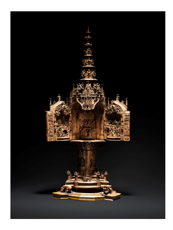
Boxwood Miniature Triptych Early 16<sup>th</sup> century, Netherlands