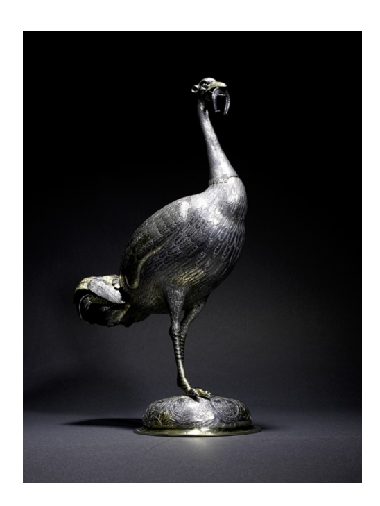
Silver Ostrich Statuette c. 1600, Augsburg, Germany