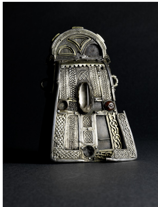
The Bell of St Mura 11 th -16 th centuries, Ireland