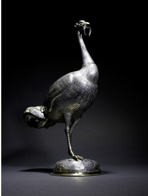
Silver Ostrich Statuette c. 1600, Augsburg, Germany