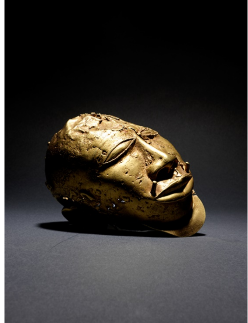
Gold Trophy Head 19 th century or earlier, Asante (Ghana)