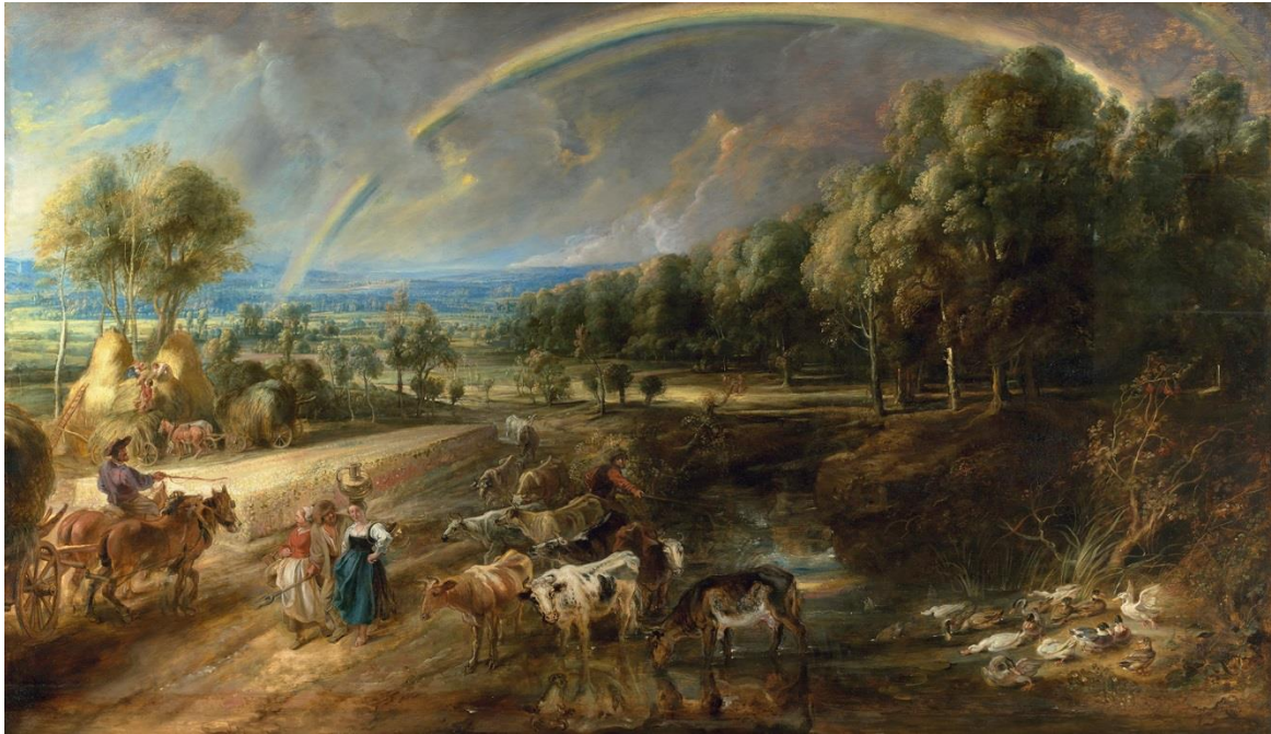
Peter Paul Rubens, The Rainbow Landscape , c. 1636

Faithful and Fearless: Portraits of Dogs